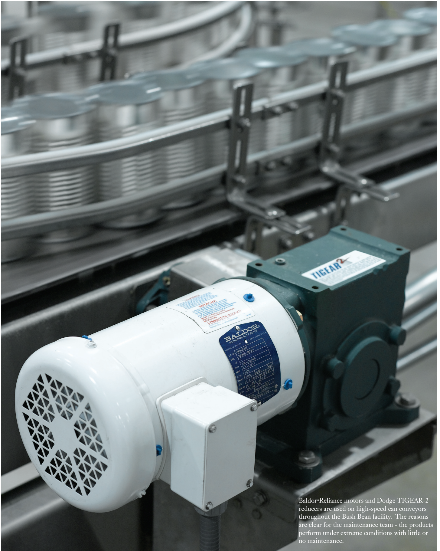
Baldor•Reliance motors and Dodge TIGEAR-2 reducers are used on high-speed can conveyors throughout the Bush Bean facility. The reasons are clear for the maintenance team - the products perform under extreme conditions with little or no maintenance.